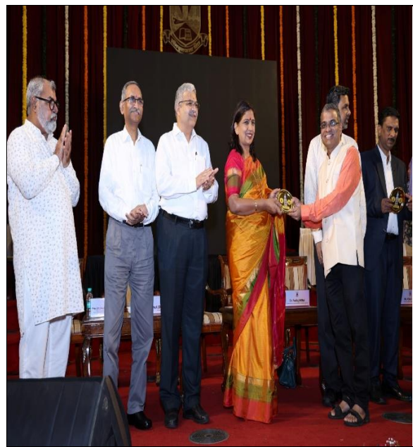
Appreciation as a District Coordinator & Member of Organizing Team in Avishkar Research Convention by Department of Students' Development, University of Mumbai