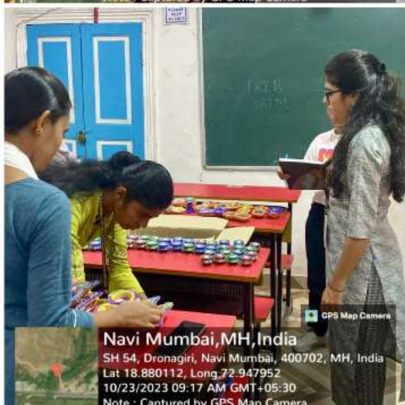
GPS Map Camera Navi Mumbai, MH, India SH 54, Dronagiri, Navi Mumbai, 400702, MH, India Lat 18.880112, Long 72.947952 10/23/2023 09:17 AM GMT+05:30 Note : Captured by GPS Map Camera