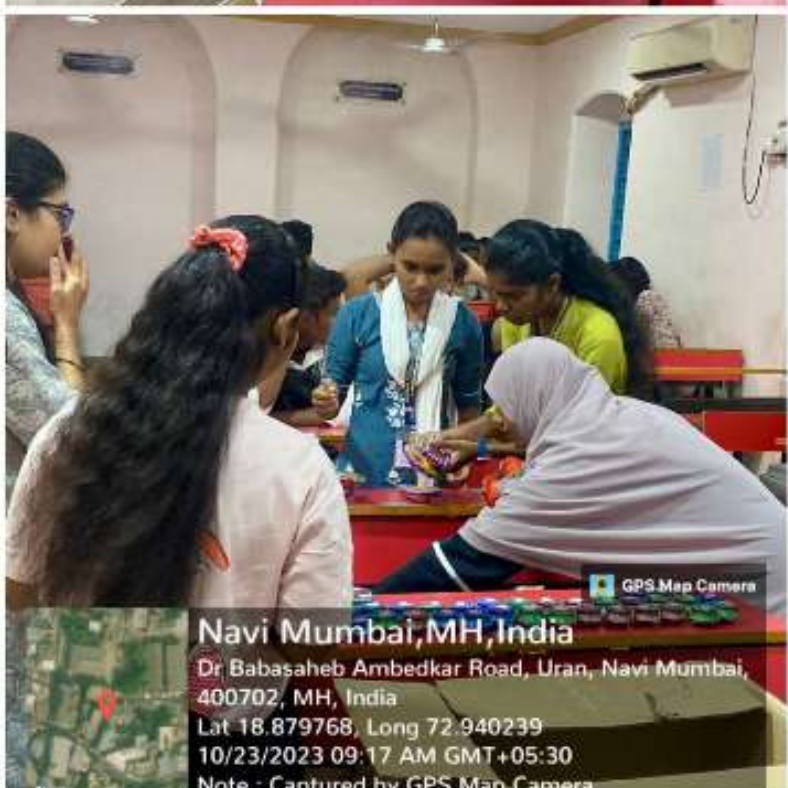
GPS Map Camera Navi Mumbai, MH, India Dr. Babasaheb Ambedkar Road, Uran, Navi Mumbai, 400702, MH, India Lat 18.879768, Long 72.940239 10/23/2023 09:17 AM GMT+05:30 Note : Captured by GPS Map Camera