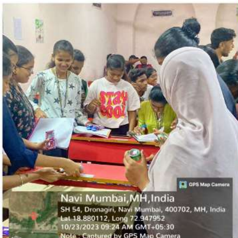
GPS Map Camera Navi Mumbai, MH, India SH 54, Dronagiri, Navi Mumbai, 400702, MH, India Lat 18.880112, Long 72.947952 10/23/2023 09:24 AM GMT+05:30 Note : Captured by GPS Map Camera